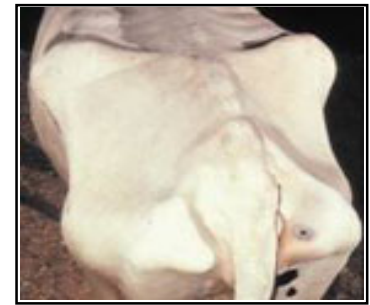
Unworthy of selling into the VPP Beef Niche Market - BCS #1