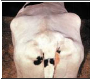
VPP Beef Niche Market Cull Cow earns a premium - BCS #3

DQC Dairy Quality Center a division of Agri-Education, Inc.